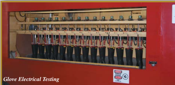
Glove Electrical Testing