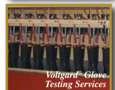
Voltgard® Glove Testing Services