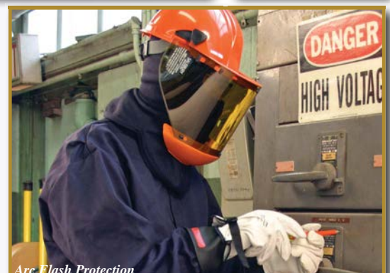
Arc Flash Protection