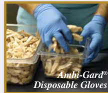
Ambi-Gard® Disposable Gloves