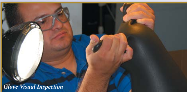
Glove Visual Inspection