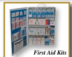
First Aid Kits