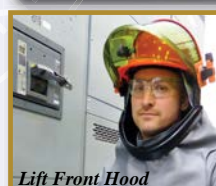
Lift Front Hood