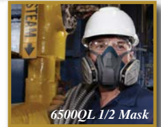
6500QL 1/2 Mask