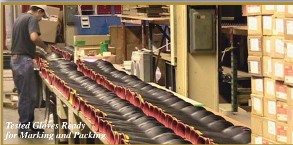
Tested Gloves Ready for Marking and Packing