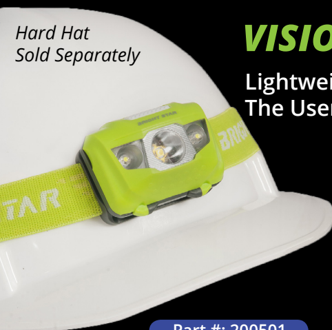
Hard Hat Sold Separately