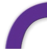
90° Curve Corner PTP211