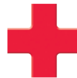
Quad Corner PTP212