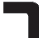
Rounded Corner PTP206