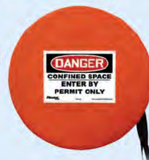
S203CS Lockable, solid