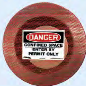
S201CS Elastic, non-lockable, ventilated