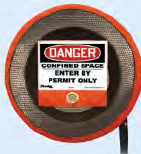
S202CS Lockable, ventilated