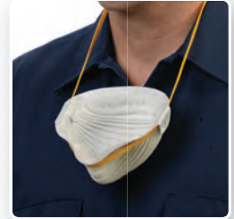
Break the take-off and toss habit