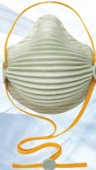
▲ 4600 N95