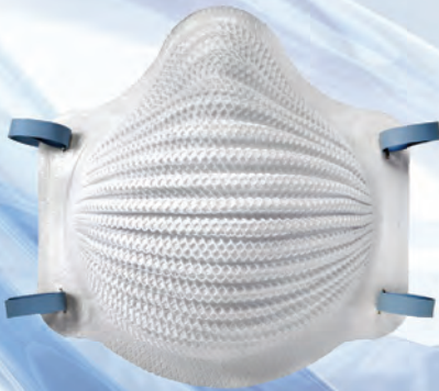
▲ 4200 N95