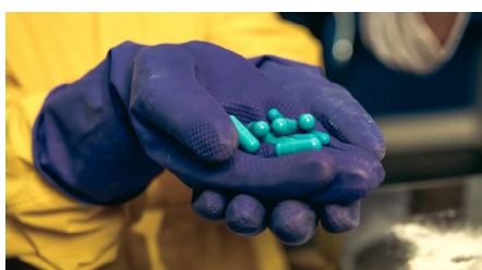
What types of gloves protect your hands from hazardous chemicals?