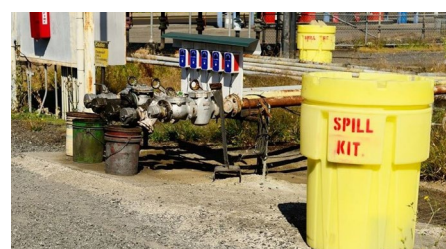
Top Tips for Preventing Chemical Spills in the Workplace