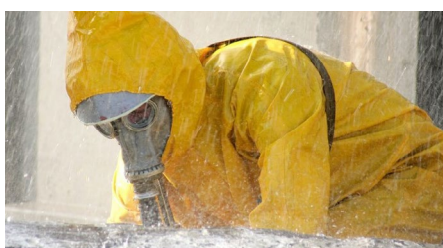
What should I look for in rainwear if I work with chemicals?