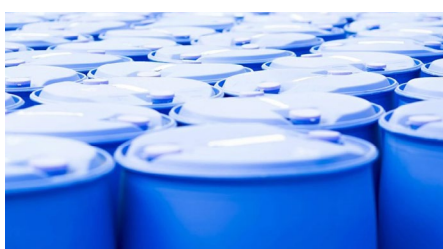
Tips for Handling and Storing Chemical Drums