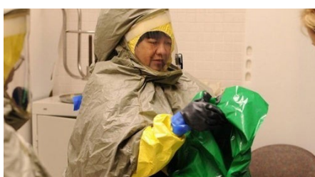
The Top 4 Pathways for Chemical Exposure