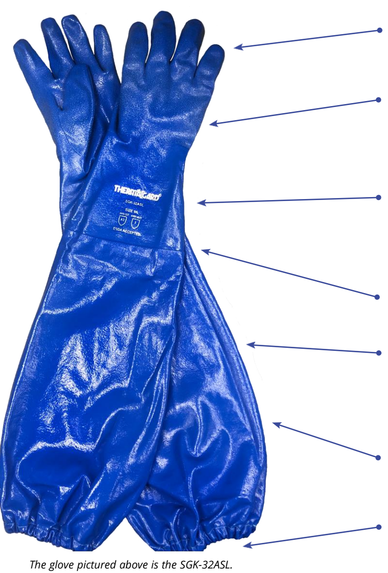
The glove pictured above is the SGK-32ASL. All of the features of this glove are the same as the SGK-32AEL, unless otherwise noted.