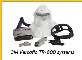
3M Versaflo TR-600 systems