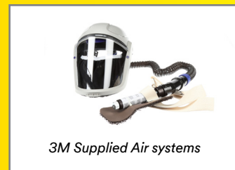
3M Supplied Air systems

The above products do not represent the full product offering. Other accessories such as headtops, chargers and valves can apply. Full product list can be downloaded from the program homepage.