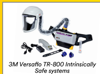
3M Versaflo TR-800 Intrinsically Safe systems