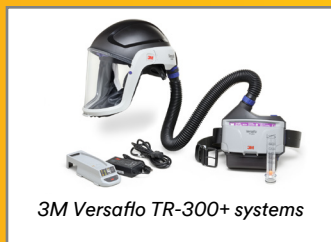
3M Versaflo TR-300+ systems

Convert using any of these 3M Versaflo Powered and Supplied Air kits and assemblies: