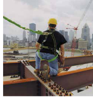
Requirements for Fall Protection

A section of the ZOLL AED Plus<sup>®</sup> part numbers are as follows: