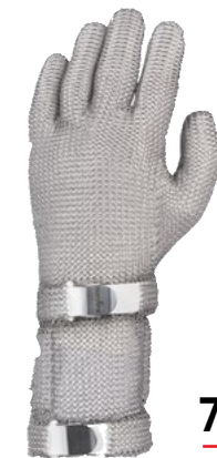
GU-2512SNS 7.5" Extended Cuff