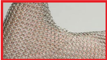
"OTHER" MESH GLOVES