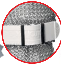
GE-2500 Wrist Length