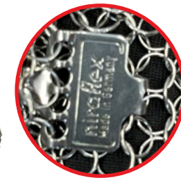
GU-2750 Wrist Length