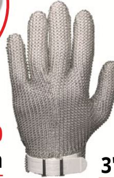
GE-2504 3" Extended Cuff