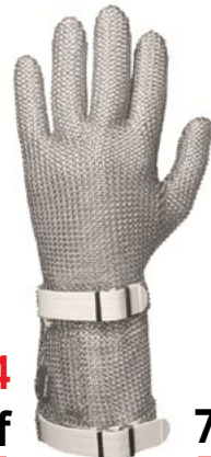
GE-2512 7.5" Extended Cuff