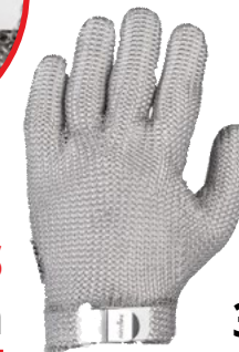
GU-2504SNS 3" Extended Cuff