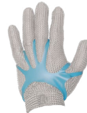
GS-100 Glove Tensioner

Even though our mesh gloves are the most ergonomically-correct mesh gloves in the world, the loose nature of ring mesh can still sometimes be a challenge for proper fit. We offer a simple, sanitary polymeric mesh glove tensioner that fits over the mesh glove on the back of the hand and provides a tighter fit for the working area of the palm and fingers without hindering comfort or dexterity. Sold by the pack of 100 each.