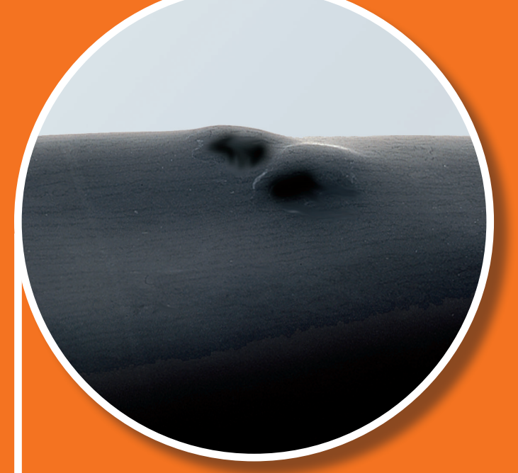
Chemical Attack: This photo shows swelling caused by oils and petroleum compounds.