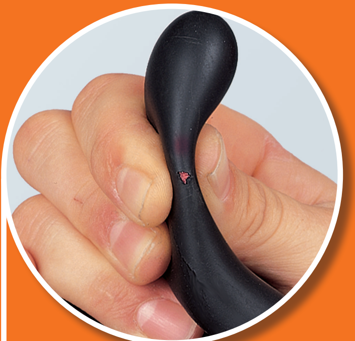
-Snags: Damage shown here is due to wood and metal splinters and other sharp objects.