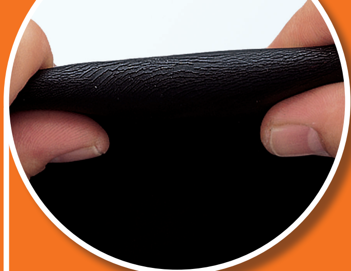
— UV Checking: Storing in areas exposed to prolonged sunlight causes UV checking.