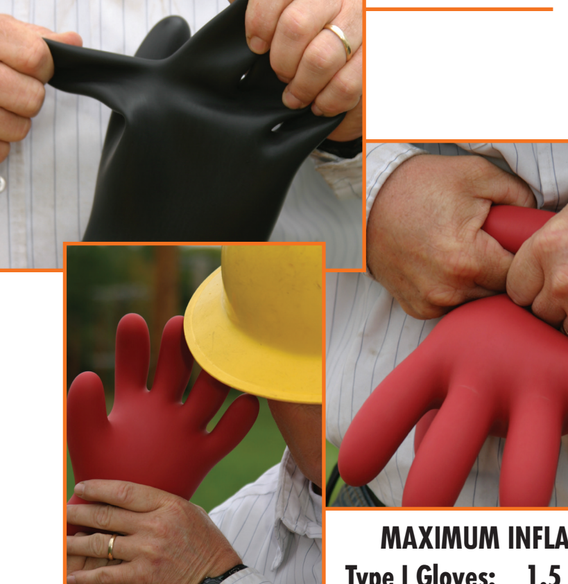
MAXIMUM INFLATION SIZE: Type I Gloves: 1.5 times normal Type II Gloves: 1.25 times normal