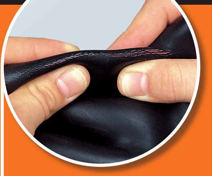
-Cracking & Cutting: Shown above is damage caused by prolonged folding or compressing.