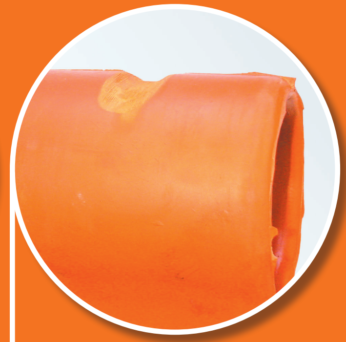
- Physical Damage: Rope burns, deep cuts and puncture hazards are cause for rejection.